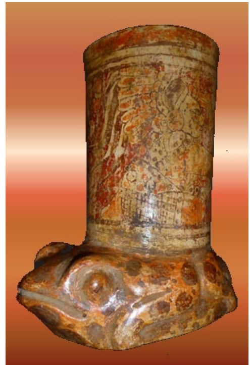
Maya Bufo toad ceremonial drinking vessel. From Keith Cleversley's private collection. Photo: Keith Cleversley. Used by permission.

I will continue with this very important question in just a few minutes but first I want to get back to the Maya. It is now very clear to us that the Bufo toad does more than just physically demonstrates the principles of transformation and rebirth, it also provides the Maya with a means to explore the spiritual world and most importantly, to discover the true fundamental self. I think that the presence of the Bufo toad in the sacred ceremonial site of Izapa speaks volumes. In fact, the statues were not just used as symbols; they were used as altars. This raises them to the highest level possible. This is strong evidence that in the eyes of the Maya, these psychedelic experiences were supremely important!